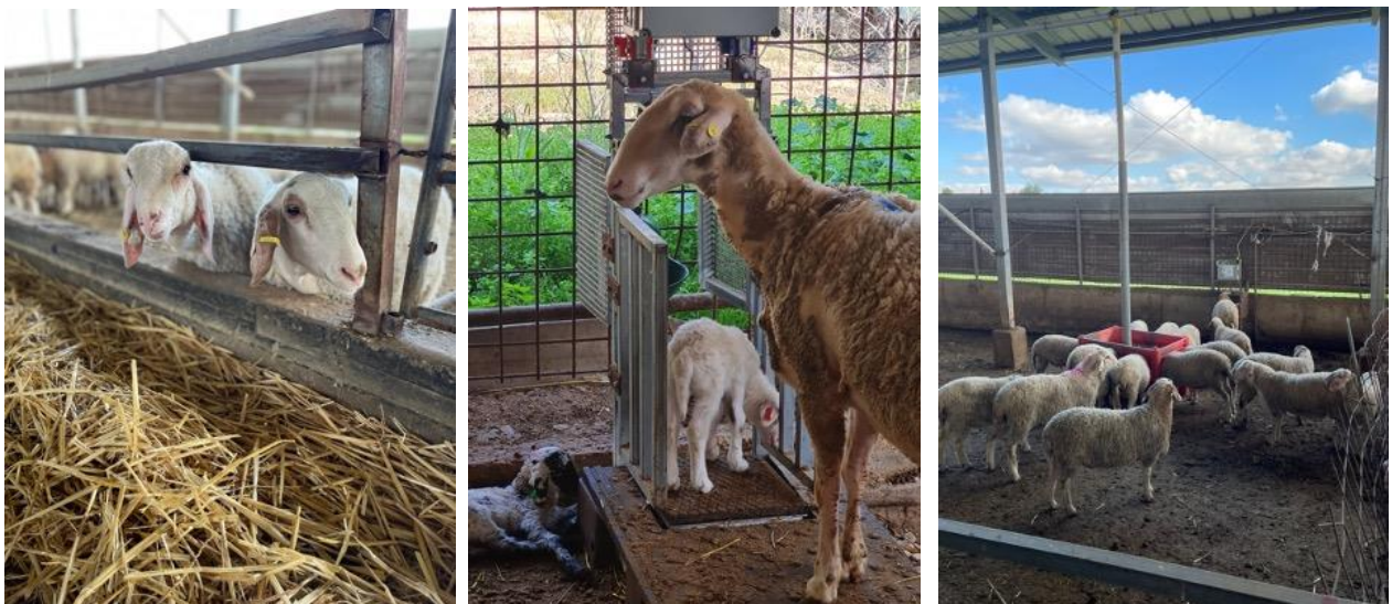
Photos from Ivry Farm were taken during the pilot, showing the devices that collected individual data for small ruminants.

The TechCare Project, a multi-actor approach project funded by the EU H2020 program, is using precision livestock farming (PLF) technologies to monitor animal welfare along the entire production chain, enabling all stakeholders to choose animal welfare-friendly products. The project aims to tackle the challenge of using innovative and low-cost technologies, adapted to small ruminant systems across the EU.